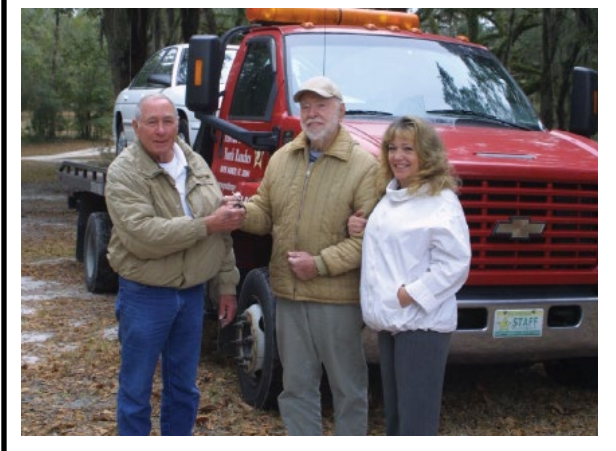
Please Note: The American Jobs Creation Act of 2004 contains new rules pertaining to the charitable deduction allowed for vehicles donated to a qualified charity after december 31, 2004. Basically, this law limits the donor's tax deduction to $500, or the gross proceeds from the sale of the vehicle, if over $500. We recognize that each individual's tax situation is different and the impact of any charitable deduction is based on a variety of circumstances. You are strongly encouraged to consult with your independent tax advisor.