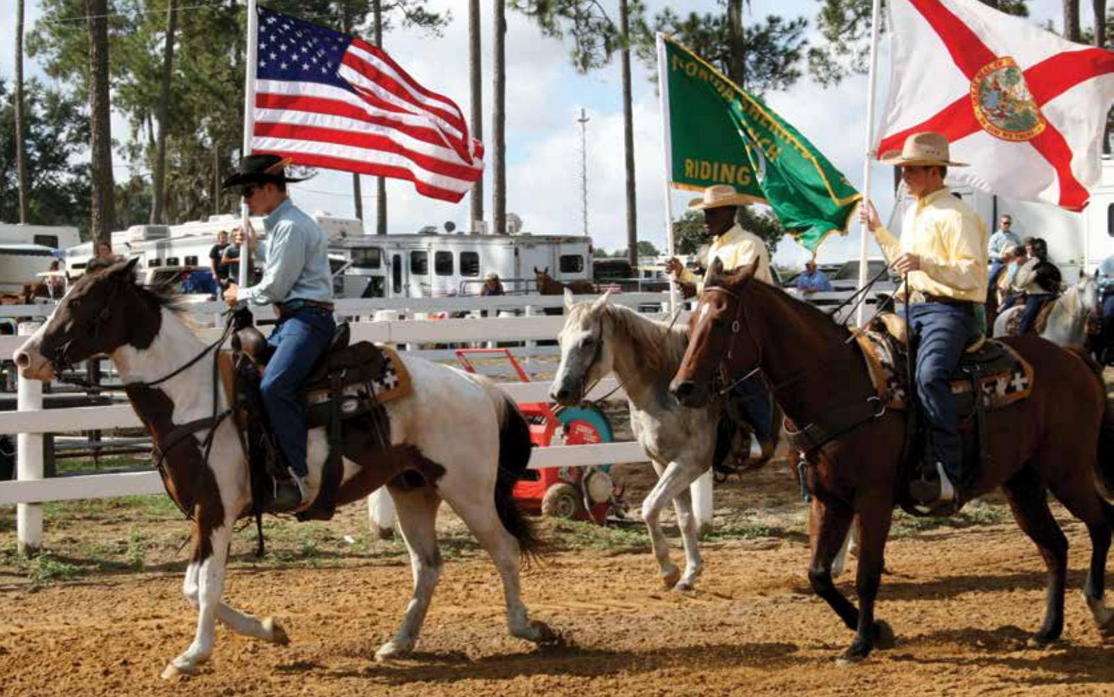
Each year the grand entry parade is a highlight of the Open House.