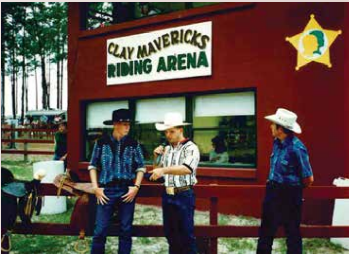
The Clay Mavericks Arena

Sheriffs from around the state rallied together and, before they knew it, 1,000 dressed chickens, 35 cases of baked beans, 200 pounds of coleslaw, 150 loaves of bread, gallons of pickles, countless cases of drinks, and all the paper goods and utensils needed had all been donated, along with 400 pounds of pork from one sheriff’s personal