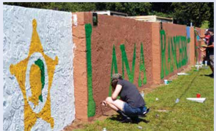
“I Am A Rancher” is the focus of the Youth Ranches recent digital branding campaign seen on Facebook and Youtube.

The mural, which was inspired by our “I am a Rancher” campaign, includes images that focus on the Youth Ranches four pillars of success; Work, Study, Pray, Play. The mural also features the Youth Ranches