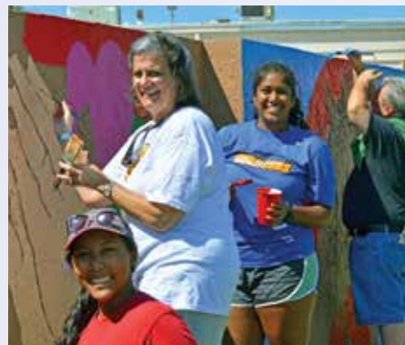
Staff, students, and volunteers came together from the community to help paint the wall.

Throughout the day, kids and volunteers took turns in a large-scale paint-by-numbers-style patchwork of images that,