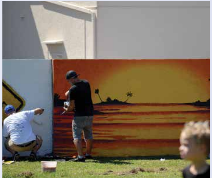
Sunset on the mural wall—just one of the amazing panels that help tell the story of the Florida Sheriffs Youth Ranches.

pointing to all of the parts he had helped paint. His favorite is the vibrant red and orange sunset.