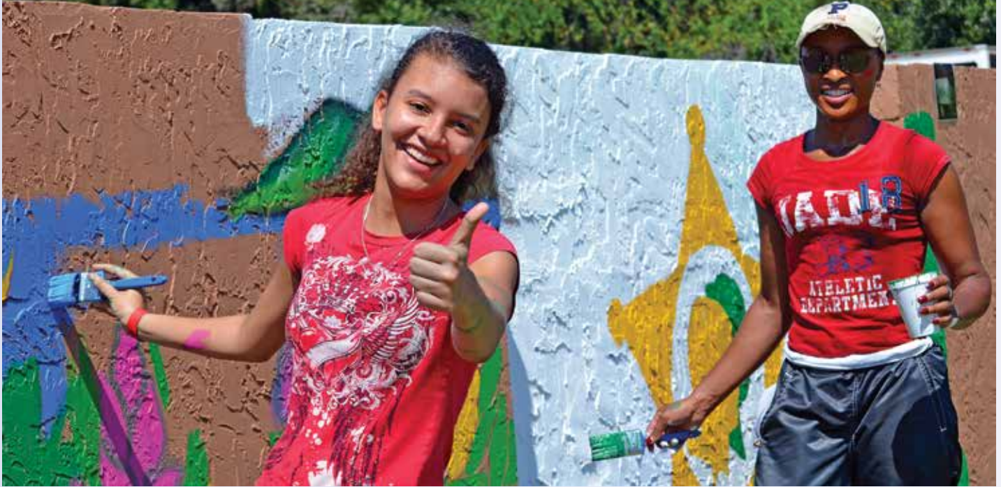
Students have a blast painting the wall.

A wall is typically used to divide or keep things separate, but at the Florida Sheriffs Youth Ranch in Safety Harbor, a wall is bringing the community together.