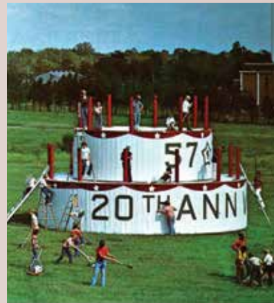
This photo featured in the Winter 1977 Edition of the Rancher shows off the Birthday Cake creation that celebrated the 20 th Anniversary of the Boys Ranch nearly 40 years ago.

more visitors and their families, it only made sense to combine the alumni reunion