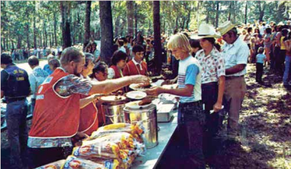
Good food has always been a staple of Open House. From the first event where the food seemed to come from a miracle to every year there after.

budget, but the leadership decided that “with faith, they would proceed anyhow.”