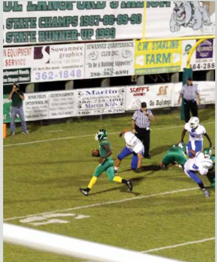
Dre in action.

Football is a game of inches. That kind of margin for error requires keen attention to detail from everyone on the field. One wrong step, one dropped pass, or one mental error can have a negative effect on